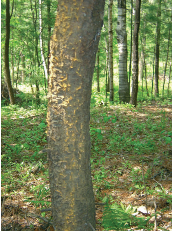
Fig. 2. Pinus koraiensis in northeastern China with large blister rust canker caused by an active infection of Cronartium ribicola . Such a large area of sporulation may not be typical of C. ribicola , but it opens a question whether this might actually indicate host tolerance whereby sporulation develops near the surface of the inner bark (phloem).