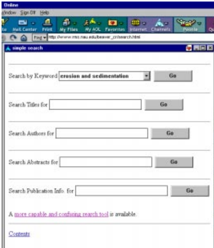
Figure 1. Format for simple searches of the Beaver Creek bibliography.

137 references that have ponderosa pine in the title. Search of the author, abstract, and publication options are similar.