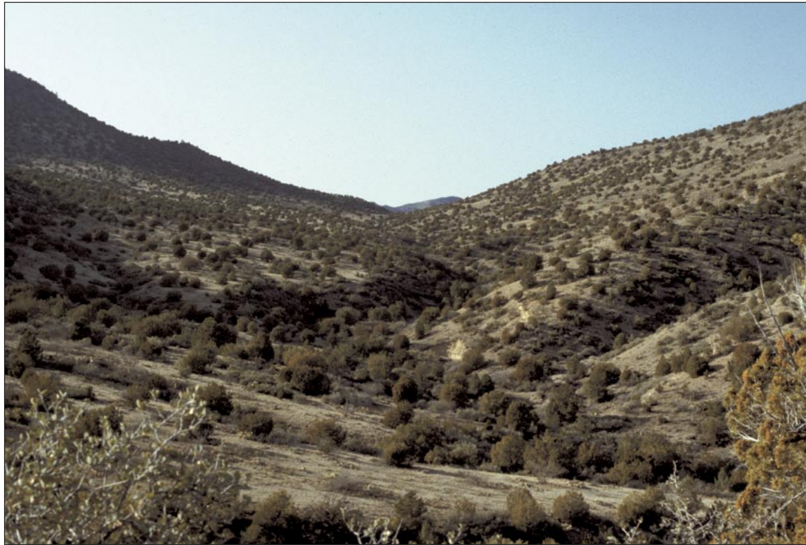
Figure 2 —Overview of relatively open pinyon-juniper woodland used during winter by radio-marked Mexican spotted owls from the Bar-M study area, Arizona. This type of habitat was used for nocturnal foraging.

5 These two records represent one female owl that migrated to the same area in two consecutive winters. This owl did not migrate in the winter of 1990-1991 (but her mate did).