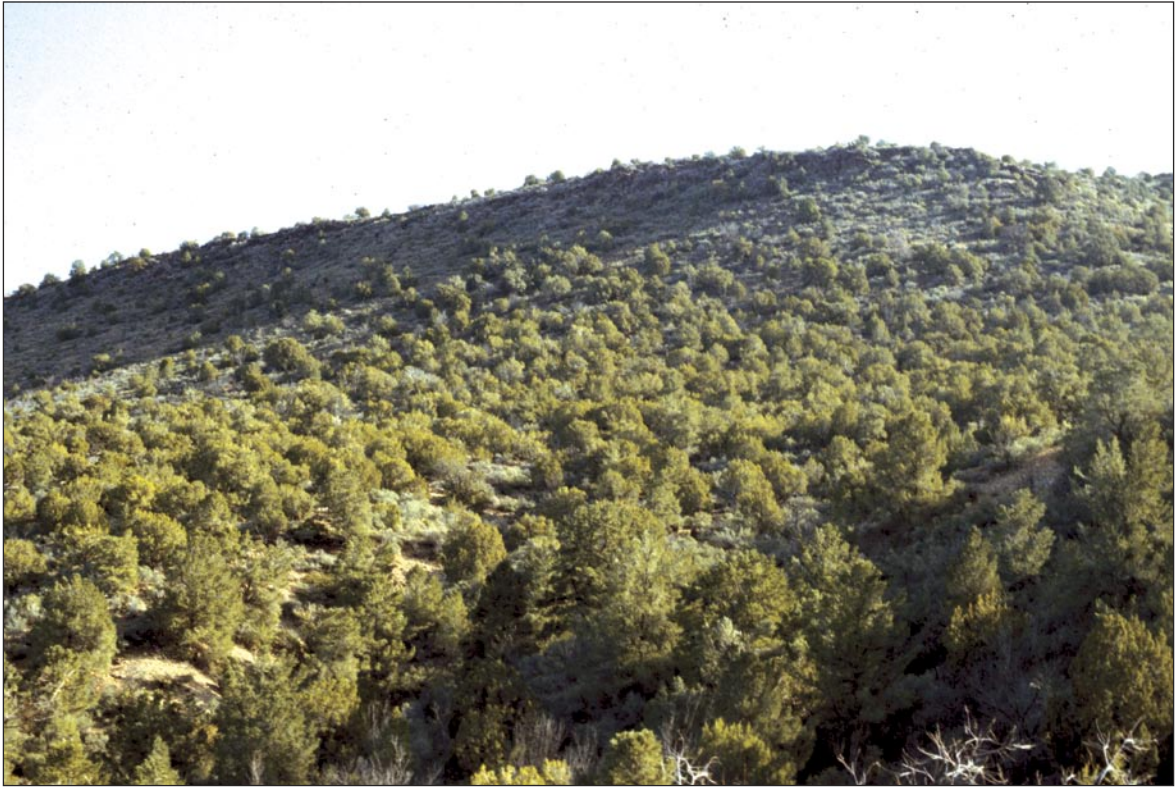
Figure 3 —Relatively dense pinyon-juniper woodland used during winter by a radio marked-Mexican spotted owl in Arizona. This area was frequently used for diurnal roosting.

move long distances. Gutiérrez and others (1996) provided another possible example of long-distance winter movement. They banded an adult female owl in 1994 as a member of a territorial pair in the Tularosa Mountains, New Mexico. This owl was found dead in January 1995 in the Chihuahuan desert near Deming, New Mexico, 187 km from the banding location. Gutiérrez and others (1996) described this as an example of adult dispersal, but given movements of radio-marked owls to low-elevation habitats during winter, we cannot rule out seasonal migration as an alternative explanation.